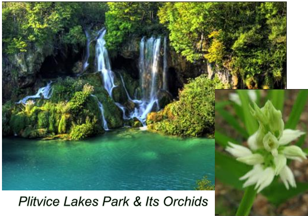
Plitvice Lakes Park & Its Orchids

March 31 - April 13, 2014 -- Land cost $2499